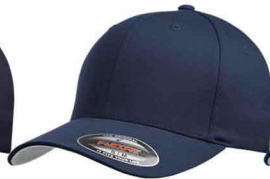
Between 533C & 534C