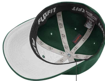
ATC™ taping on inside seams