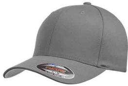
Cool Grey 11C