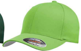
Between 367C & 368C