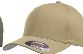
Few Shades Lighter Than 7504C