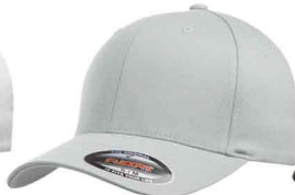
Between Cool Grey 6C & Cool Grey 7C