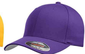
A Little Darker Than 7680C