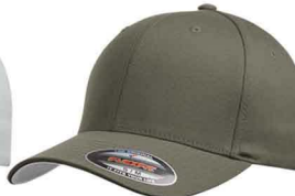
A Little Darker Than 7540C