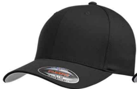
Neutral Black C