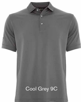
Cool Grey 9C