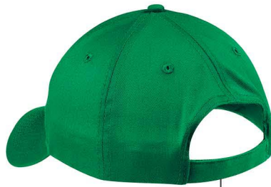
Adjustable hook and loop closure