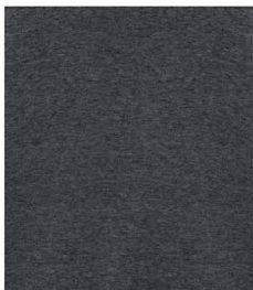
425C & 426C